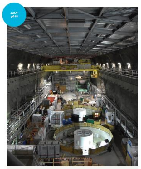
The powerhouse cavern view in August 2018. The water bypass facility, located a few levels below and in front to the office complex in the background, was commissioned in May 2018. Generator 3 was the first turbine/generator to go into service in July, right on schedule, and Generator 1 and 2 will go into service in October. The control room is in the office complex, though no staff are needed—it is controlled remotely from BC Hydro's Fraser Valley Operations.

Powerhouse view from the service tunnel in September 2016. InPower BC, a subsidiary of SNC-Lavalin, consists of a team of contractors that includes Aecon Group (cvIII work), Frontier-Kemper (rock drilling and blasting), and General Electric (turbine/generator). With approximately 2.2 km of underground tunnels, and a powerhouse cavern that's 10 storeys high and as long as a football field, we removed about 300_000 cubic metries of rock. This picture shows the powerhouse curven in September 2016